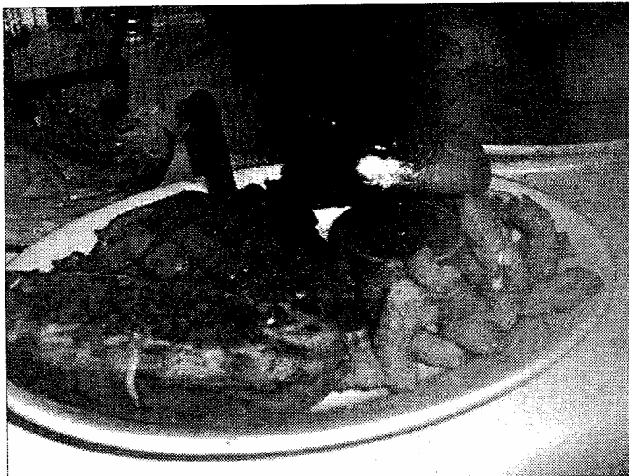
The Steak & Shrimp Special at Vince's North Port Restaurant was outstanding, accompanied by a delicious stuffed baked potato.